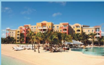
Nikki Beach with Plaza Doors Turks and Caicos

Call us or visit us on the web 561-578-5450 www.plazadoor.com